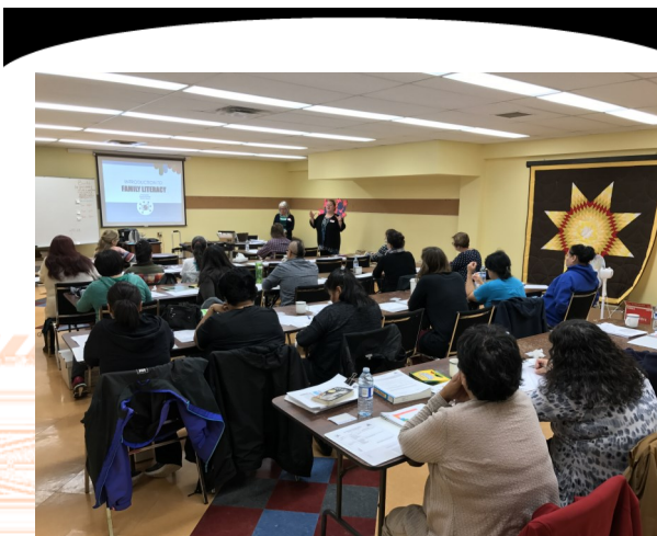
The Saskatchewan Literacy Network provided two Family Literacy training sessions as part of the 2017 PNLS Northern Library Conference.