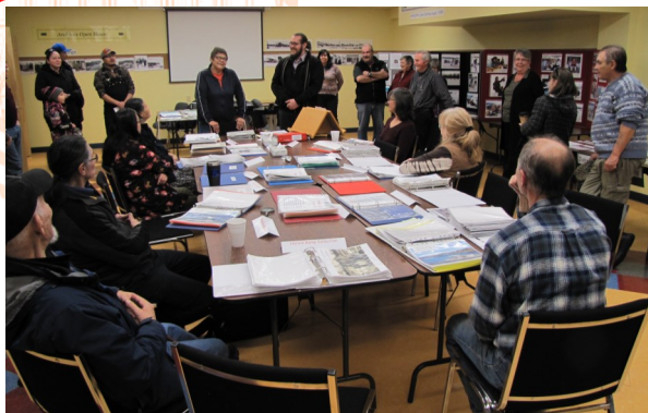
The 2017 Northern Saskatchewan Archives Open House, held on the second floor of PNLS Headquarters.