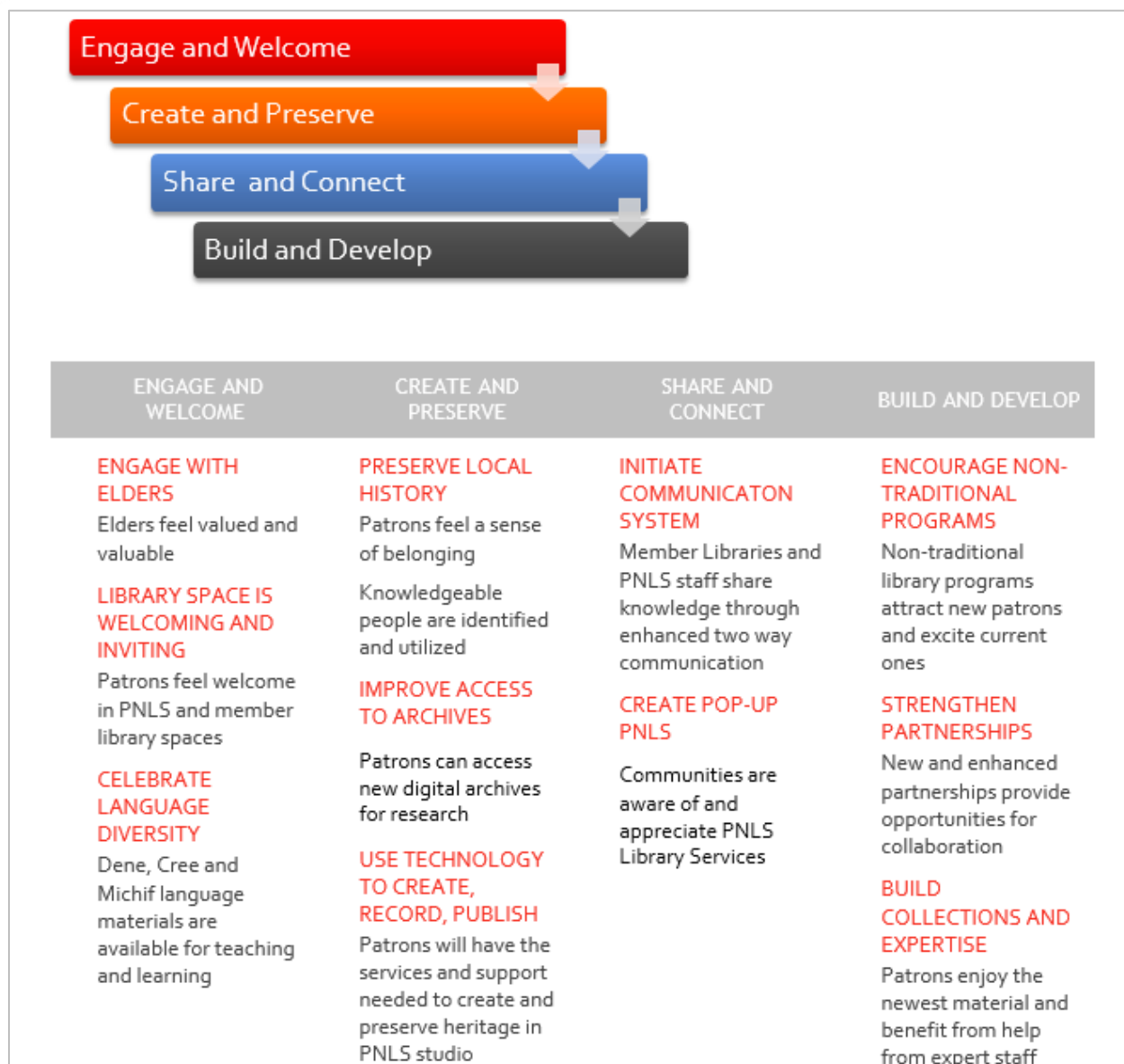
PNLS Strategic Plan 2016–2019, goals section, p.5

Meanwhile, on the broader scale of the province of Saskatchewan as a whole, a provincial library funding crisis in early 2017 caused a destabilizing effect on the library sector and became the eventual impetus for discussions around long-term strategic goalsetting at the provincial level. This led to the creation of a provincial library engagement panel struck to gather feedback and determine next steps, and after consultation with library stakeholders—including a meeting with the PNLs Executive Committee in November of 2018—that provincial working group would ultimately produce The Provincial Public Library Sector Plan, 2022–2027 .