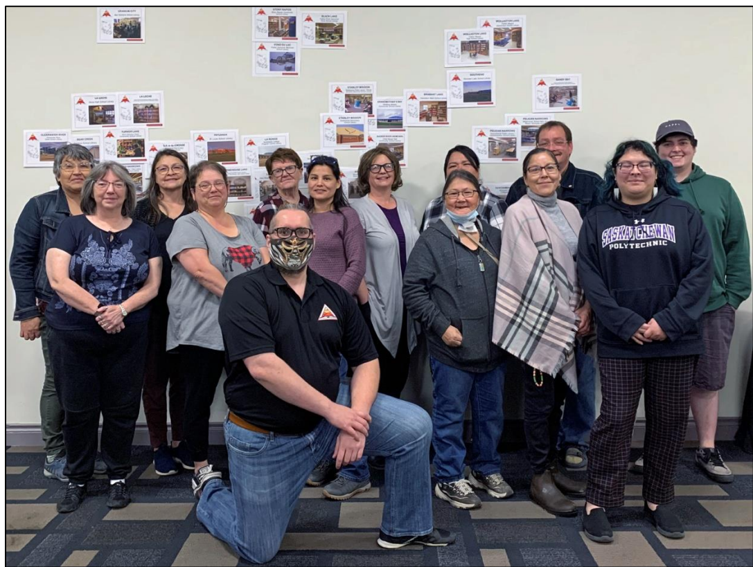
PNLS strategic planning session group, October 13, 2023

Improved supports for representation, diversity and inclusion (e.g. more training options and recruitment efforts for Indigenous and newcomer candidates to become library workers or to pursue library careers)